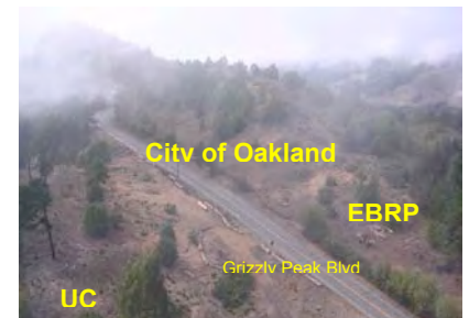
The Hills Emergency Forum facilitates a cooperative approach among eight governing organizations addressing urban wildland interface fire issues in the Oakland-Berkeley hills.